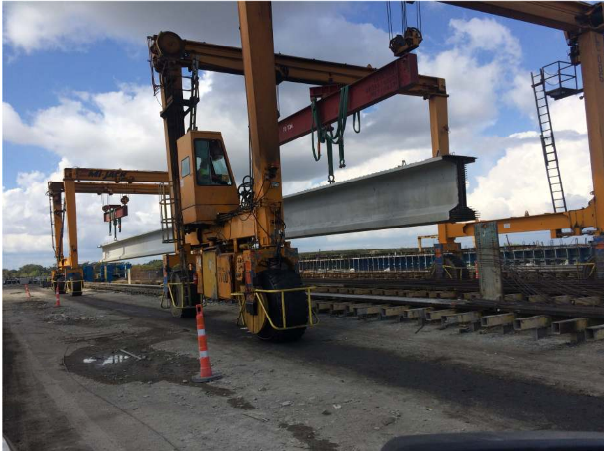
Figure 1. Typical prestressed bridge beam being fabricated

It is also possible that other benefits may also be achieved when the mixes are used in commercial operations.